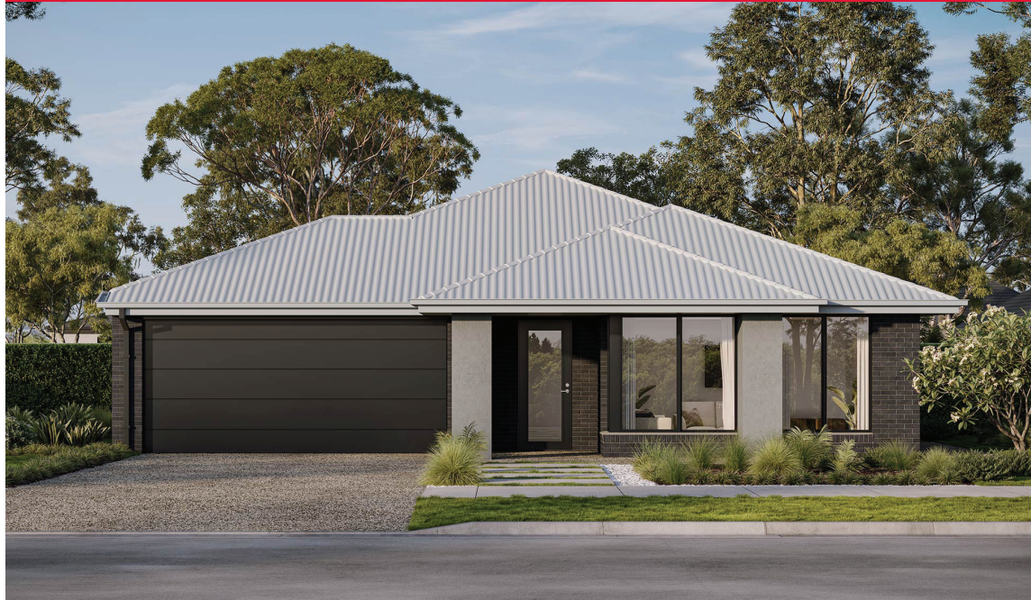
KALBARRI 28 | ELEVATE RANGE